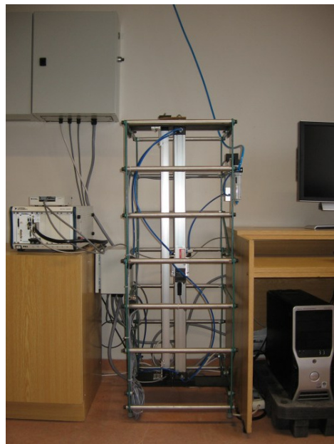
Figure 1: Pneumatics system

supply to the system. As the pressure of compressed air in the supply pipe fluctuates the pressure of the brought air to the system has to be kept on constant level by means of proportional reduction valve Festo VPPM-6L-L-1-618-0L10H-A4P-S1C1. After setting the pressure of the air on required value the air is brought to the input of proportional mass valve Festo MPYE-5-1/8-HF-010-B. The pressure in the working chambers of pneumatic cylinder with one-sided piston with the 960 mm stroke is set by means of the movement of slide valve.